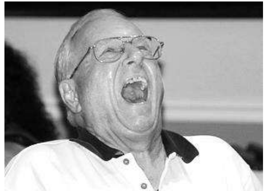
Lots of laughs!