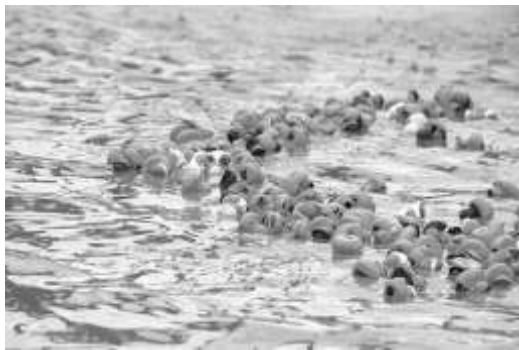
The race is on!