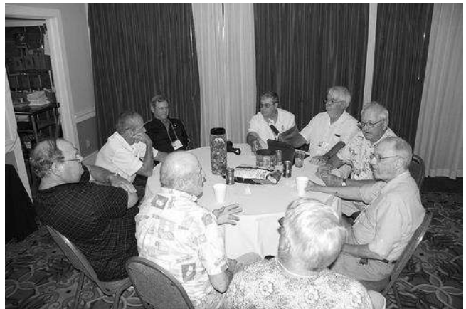
We tried to settled the world's affairs.