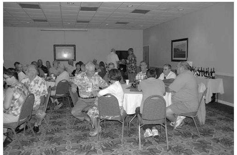
Eating again – Saturday night banquet