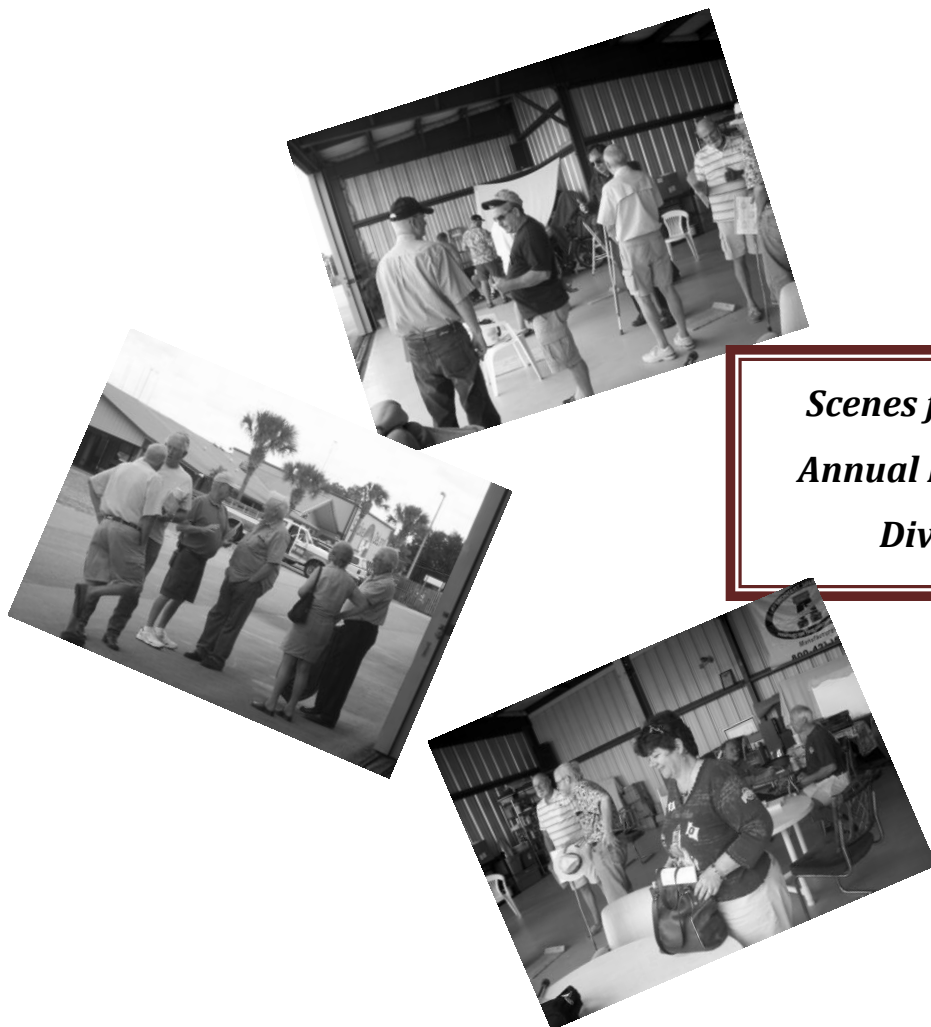
Scenes from the 2012 Annual Meeting at Sky Dive Deland.

«firstname» «lastname» «address1» «address2» «city» «state» «zipcode»