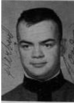
1959 post grad.

Memorial services were conducted on Monday, November 15, 2010 at the First United Methodist Church of Granite Falls.